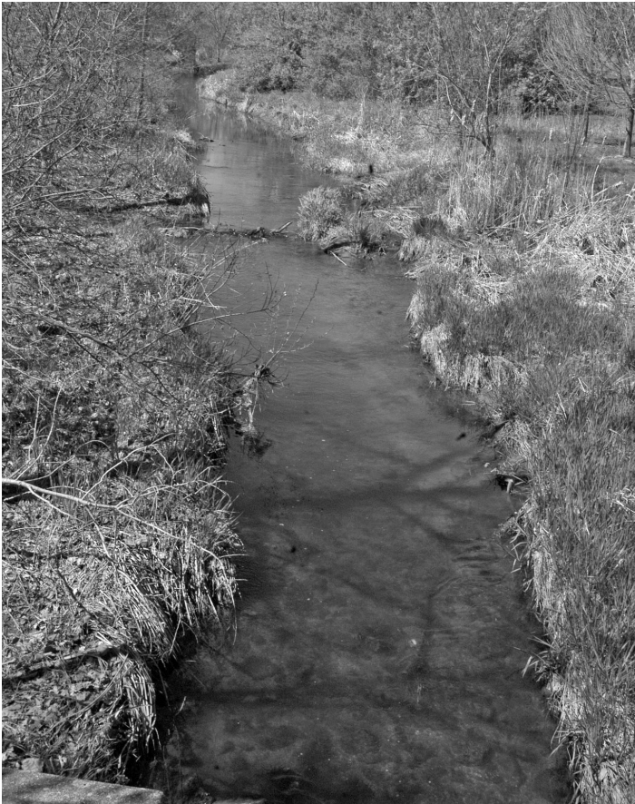
Mummichog locality: Minnow Pond Creek (Oakland County, MI)

low pelvic and anal fins which, breeding Banded Killifish get. We found this rather exciting as this fish had never been sampled in the Rouge River before. Not bad for a first day of the survey.