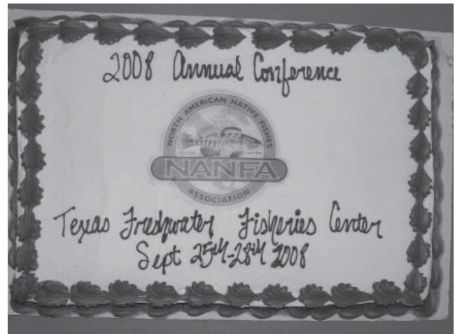
The Cake provided by the conference organizers

be given out each year to the next host. Also there was talk about having a convention committee to help out with each year's convention. This would be made up of NANFA members along with hosts from previous years. At the afternoon break this year we had a sheet cake made with the NANFA logo on it. And before we had dismissed for cake I told everyone that they were going to be able to cut their own piece of cake, and they could have as much as they wanted. Well after a few minutes of talking with some folks I walked to the cake and much to my surprise no one had cut into it.